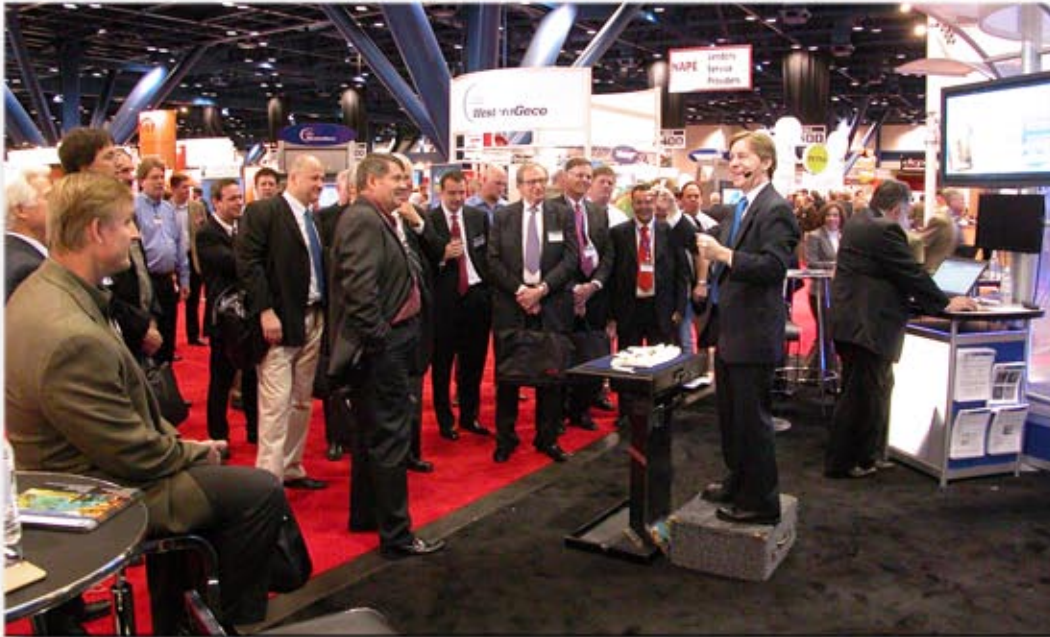
NAPE Trade Show